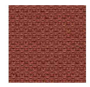
Red Clay 1252