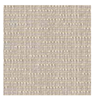
Refined Marble 1042