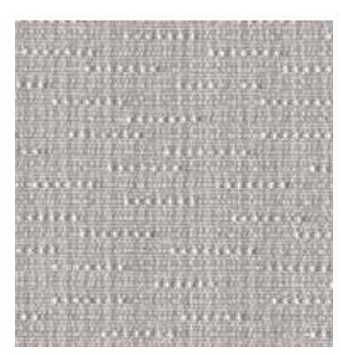
Polished Slate 1044