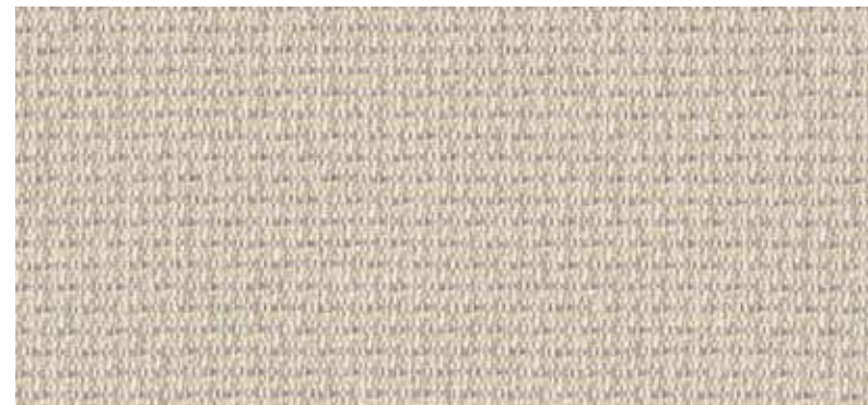
White Linen 7040