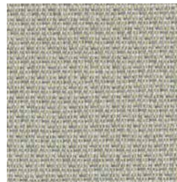
Mist Grey 7051