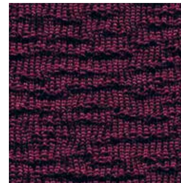
Deep Violet 112